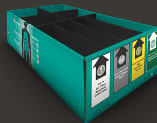
Vertical Orientation (short side facing out)